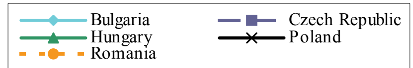
Chart 1 – Europe in Transition, Lesson 3